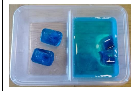
You could create a film of your results.

Research how to make a terrarium and re-use a plastic bottle and make