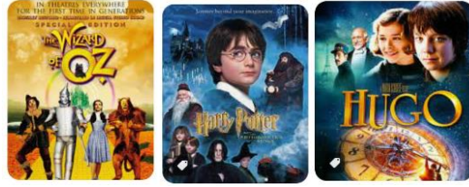
Or any of the films based on the books opposite

Plan out the storyline for your flick book, making sure to keep most of the action in the bottom right hand corner. Keep your story simple and make sure you tell the story entirely through your drawing. Something quick and easy works well, like a bouncing ball or a jumping frog.